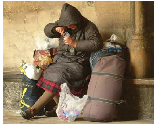
Homelessness turned out to be a major, though unavoidable problem of transition, the one of social costs of 'Balcerowicz Plan'.