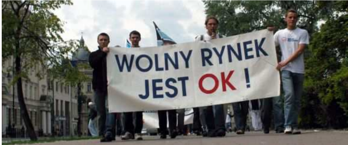
Free market is OK – a demonstration of economic freedom supporters.