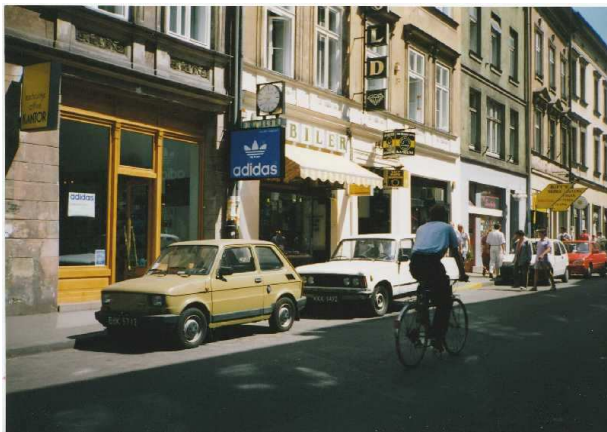
Western brands turned up in Polish towns at the beginning of 1990s. Big cities inhabitants found it easier to adapt themselves to the new reality.

Young men who work in my enterprise usually do not appear on Monday morning. They are too drunk after the weekend. Fortunately, women are more reliable.